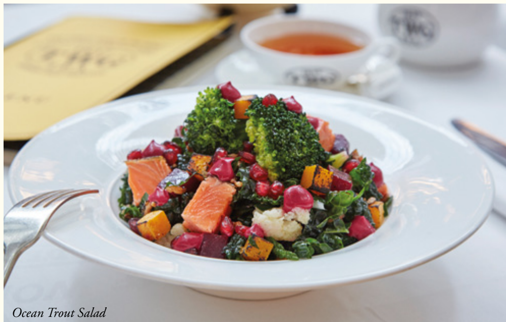
Ocean Trout Salad