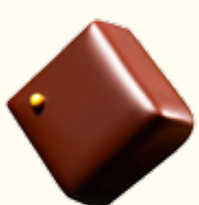
Grand Wedding Tea & Passion Fruit