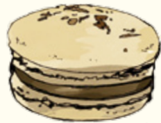
Vanilla Bourbon Tea & Blackcurrant