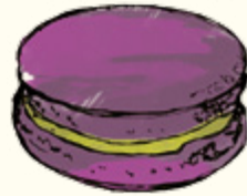
Grand Wedding Tea, Passion Fruit & Coconut