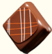
Polo Club Tea, Chestnut & Apricot