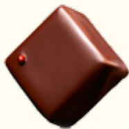
Singapore Breakfast Tea & Hazelnut