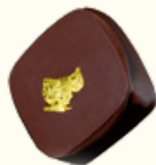
Earl Grey Fortune, Dark Chocolate Ganache