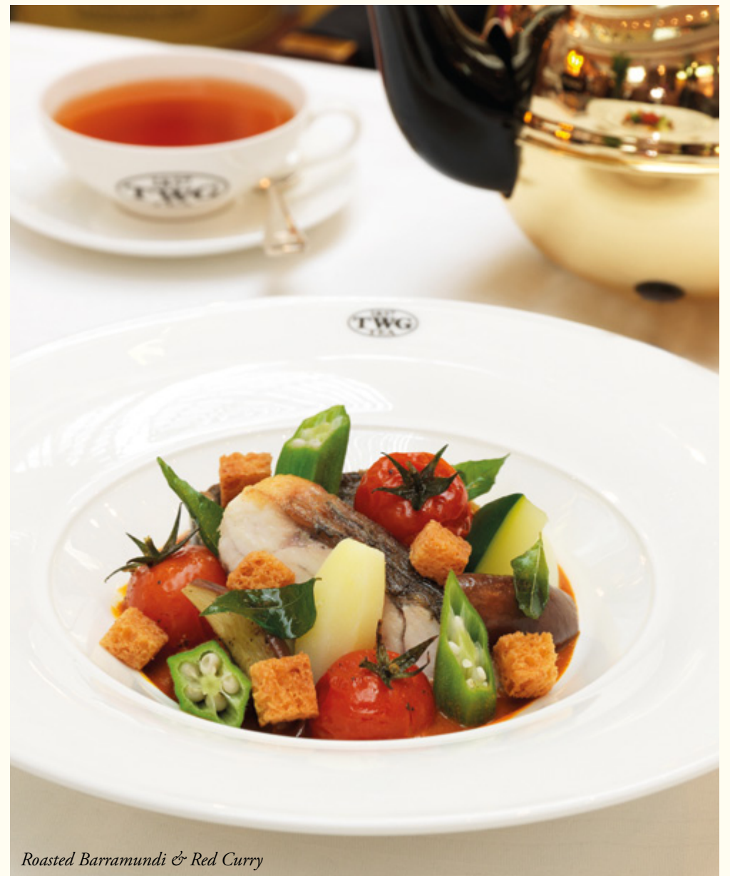
Roasted Barramundi & Red Curry