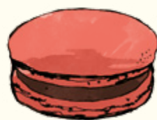
Bain de Roses Tea