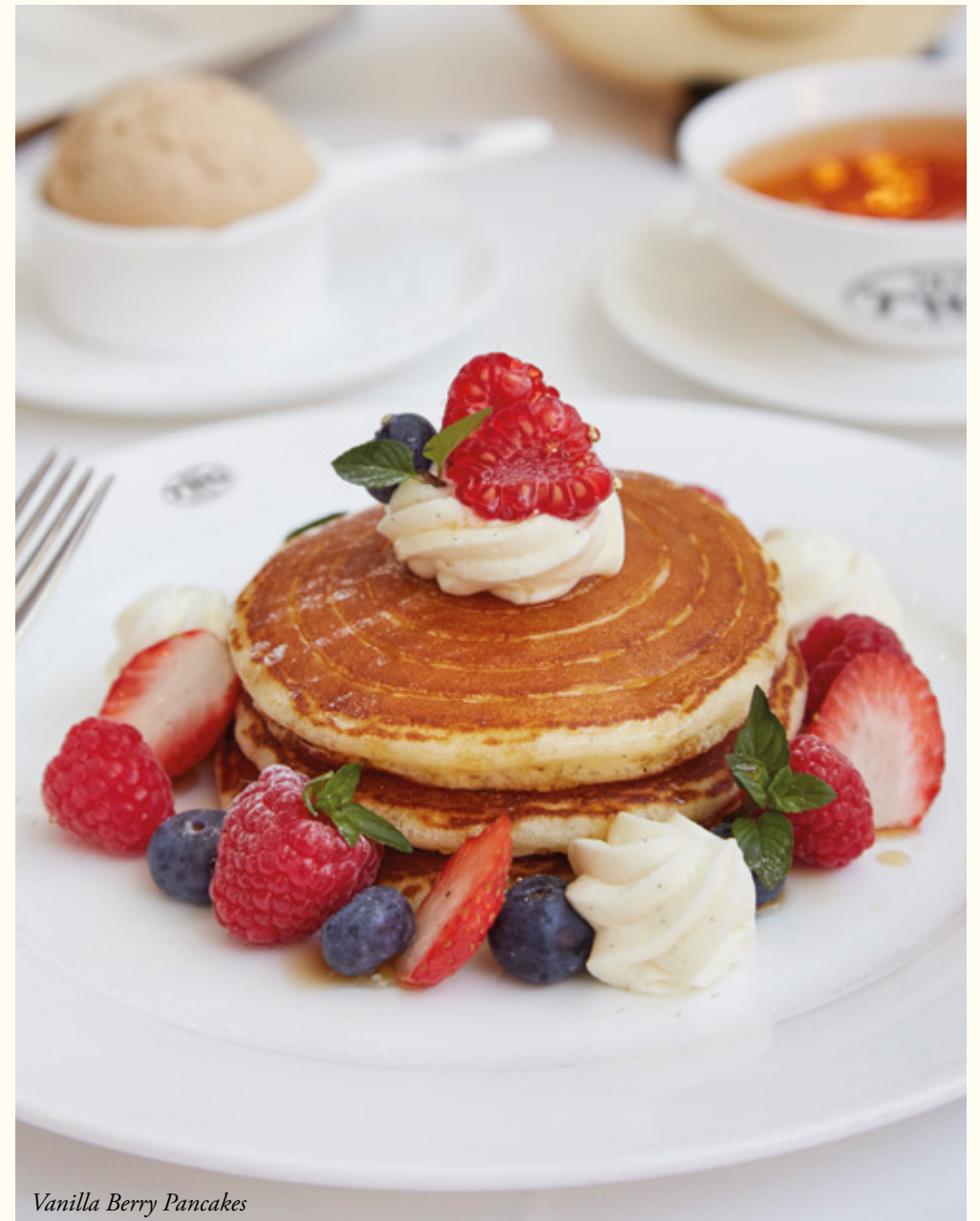
Vanilla Berry Pancakes

Waffles accompanied by poached pears infused with Red Christmas Tea served with chocolate sauce, almond slices and a choice of one scoop of tea ice cream or sorbet.