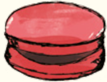
1837 Black Tea & Blackcurrant