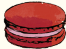
Silver Moon Tea & Strawberry