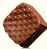
Brothers Club Tea, Maple Syrup & Pecan