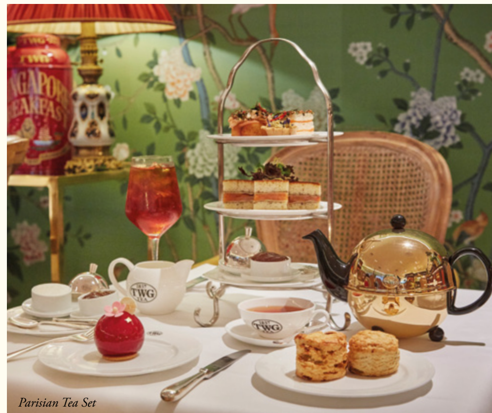
Parisian Tea Set