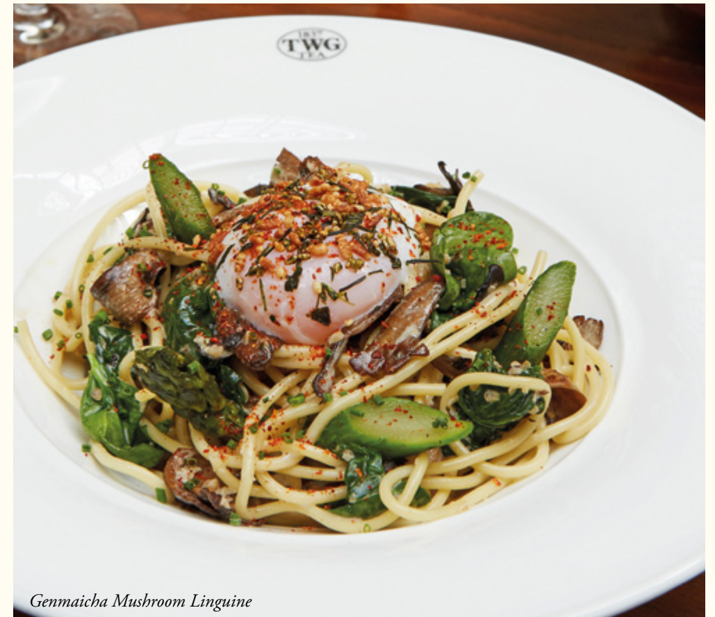
Genmaicha Mushroom Linguine

Toasted artisanal English muffins topped with two poached free-range eggs accompanied by a petite mesclun salad tossed in an 1837 Green Tea infused vinaigrette and a choice of beef pastrami, smoked salmon or guacamole with feta cheese, served with a choice of orange and saffron hollandaise sauce or béarnaise sauce.