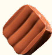
African Ball Tea, Peanut & Salted Caramel