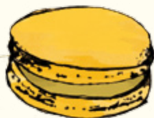
Lemon Bush Tea