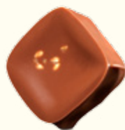
Miraculous Mandarin Tea, Sesame & Honey