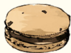
Number 12 Tea & Tiramisu