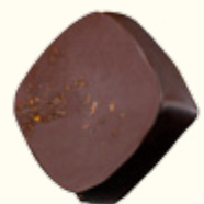
Vanilla Bourbon Tea, Dark Chocolate Apricot