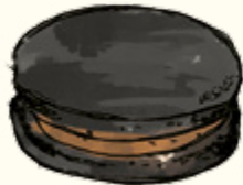
Napoleon Tea & Caramel