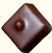
White Night Jasmine Tea, Dark Chocolate Ganache

Only available at TWG Tea Salons & Boutiques at MBS on the Bay and Takashimaya B2