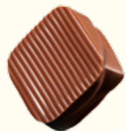
1837 Green Tea, Raspberry & Caramel