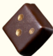
Matcha Nara, White Chocolate Ganache