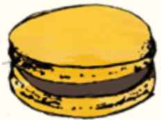
Lemon Bush Tea