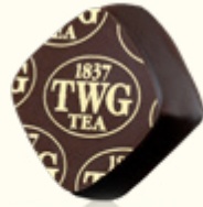
1837 Black Tea, Dark Chocolate Ganache