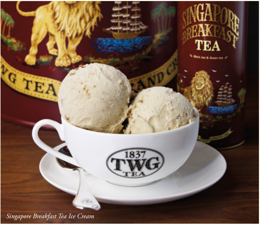
Singapore Breakfast Tea Ice Cream