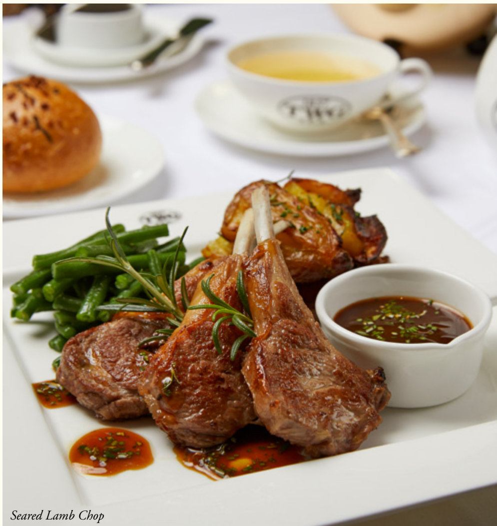
Seared Lamb Chop

Seared New Zealand lamb chop accompanied by green beans and smashed potatoes, served with a Houjicha infused black garlic and rosemary lamb jus.