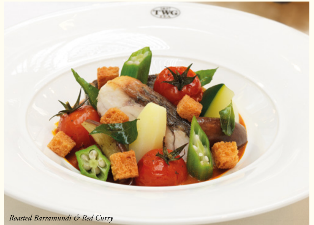
Roasted Barramundi & Red Curry