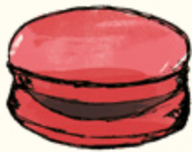
1837 Black Tea & Blackcurrant