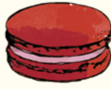
Silver Moon Tea & Strawberry