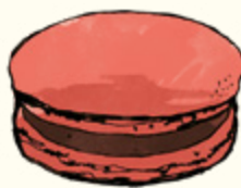
Bain de Roses Tea