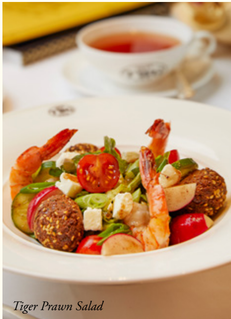
Tiger Prawn Salad