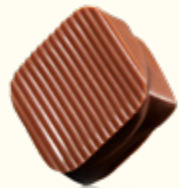
1837 Green Tea, Raspberry & Caramel