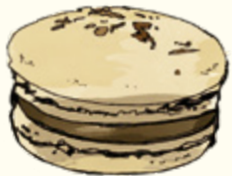
Vanilla Bourbon Tea & Blackcurrant