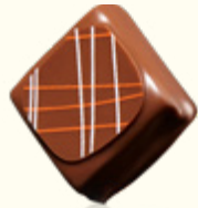
Polo Club Tea, Chestnut & Apricot