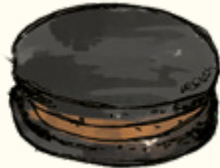
Napoleon Tea & Caramel