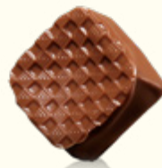
Brothers Club Tea, Maple Syrup & Pecan