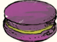
Grand Wedding Tea, Passion Fruit & Coconut