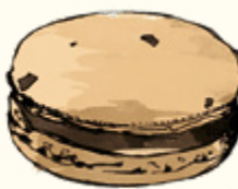
Number 12 Tea & Tiramisu