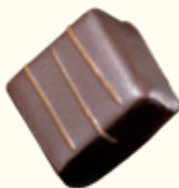
Napoleon Tea & Caramel