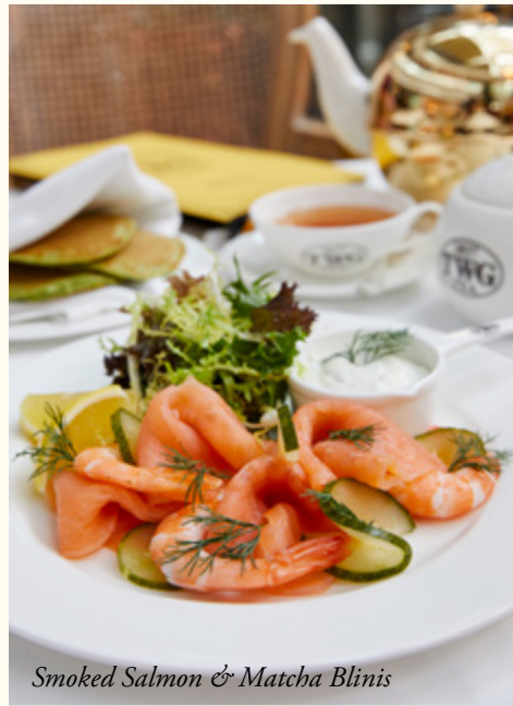
Smoked Salmon & Matcha Blinis