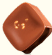
Miraculous Mandarin Tea, Sesame & Honey