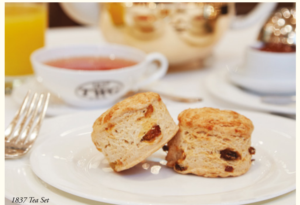
1837 Tea Set