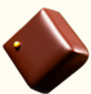
Grand Wedding Tea & Passion Fruit