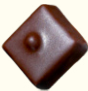
White Night Jasmine Tea, Dark Chocolate Ganache

Only available at TWG Tea Salons & Boutiques at MBS on the Bay and Takashimaya B2