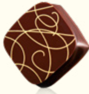
Lemon Bush Tea, White Chocolate Ganache