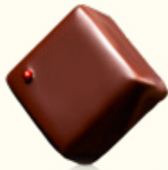
Singapore Breakfast Tea & Hazelnut