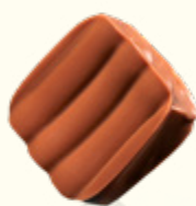
African Ball Tea, Peanut & Salted Caramel