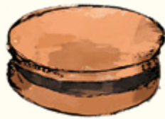
Earl Grey Fortune & Chocolate