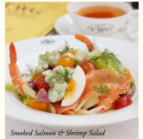
Smoked Salmon & Shrimp Salad